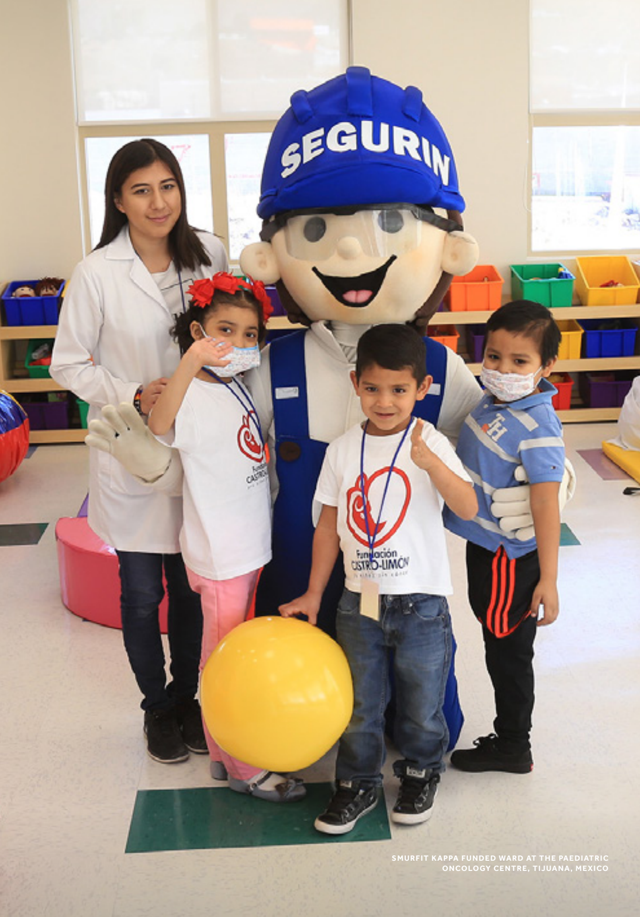
SMURFIT KAPPA FUNDED WARD AT THE PAEDIATRIC ONCOLOGY CENTRE, TIJUANA, MEXICO

The apartment is located in Florence close to the Meyer Hospital which has a team of specialist doctors caring for children affected by this rare and still relatively unknown disease.