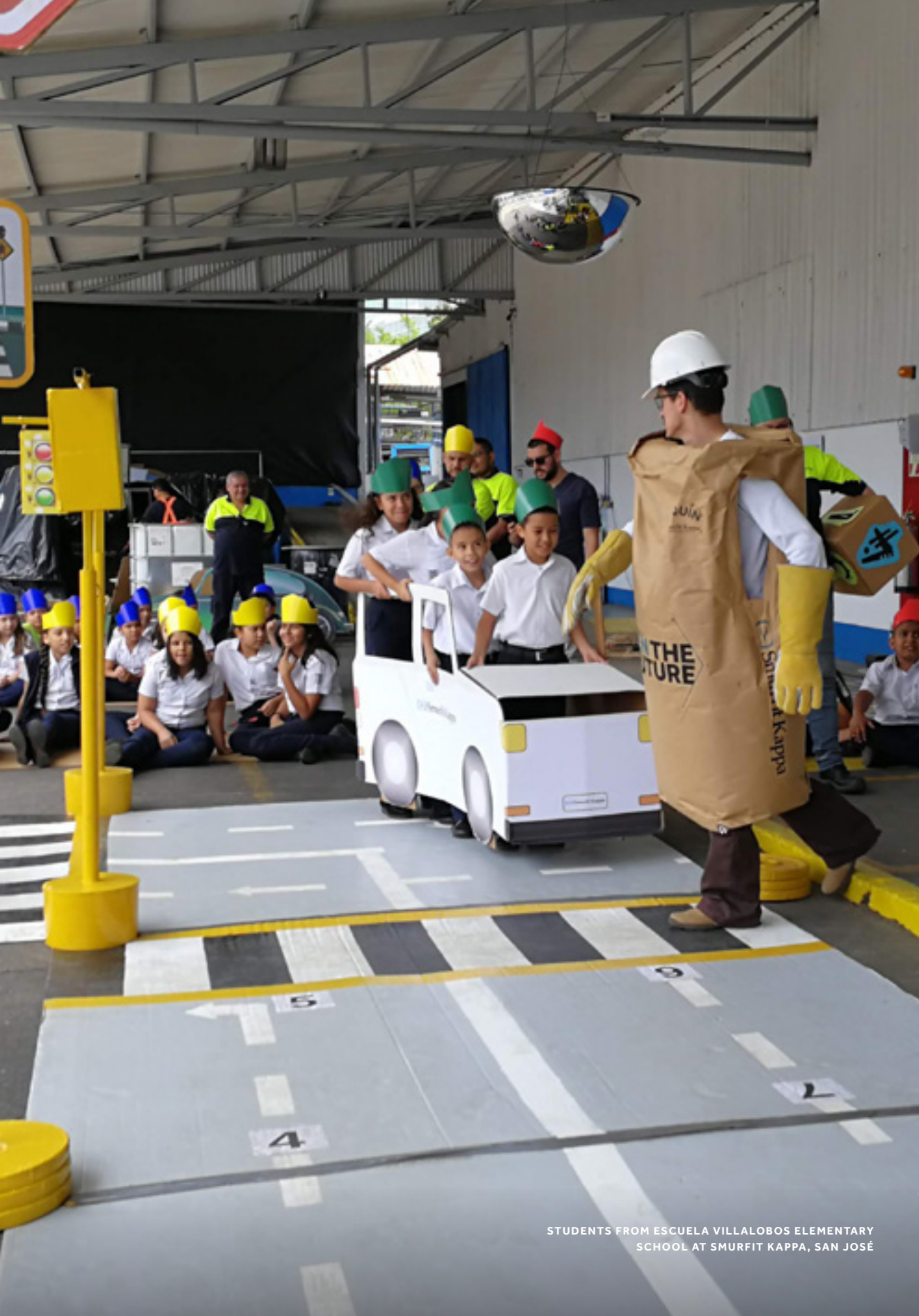
STUDENTS FROM ESCUELA VILLALOBOS ELEMENTARY SCHOOL AT SMURFIT KAPPA, SAN JOSÉ

A proposal was made to the school to help the children become ambassadors of road safety. The children really enjoyed the event, and some of them said they wanted to work for Smurfit Kappa when they grow up!