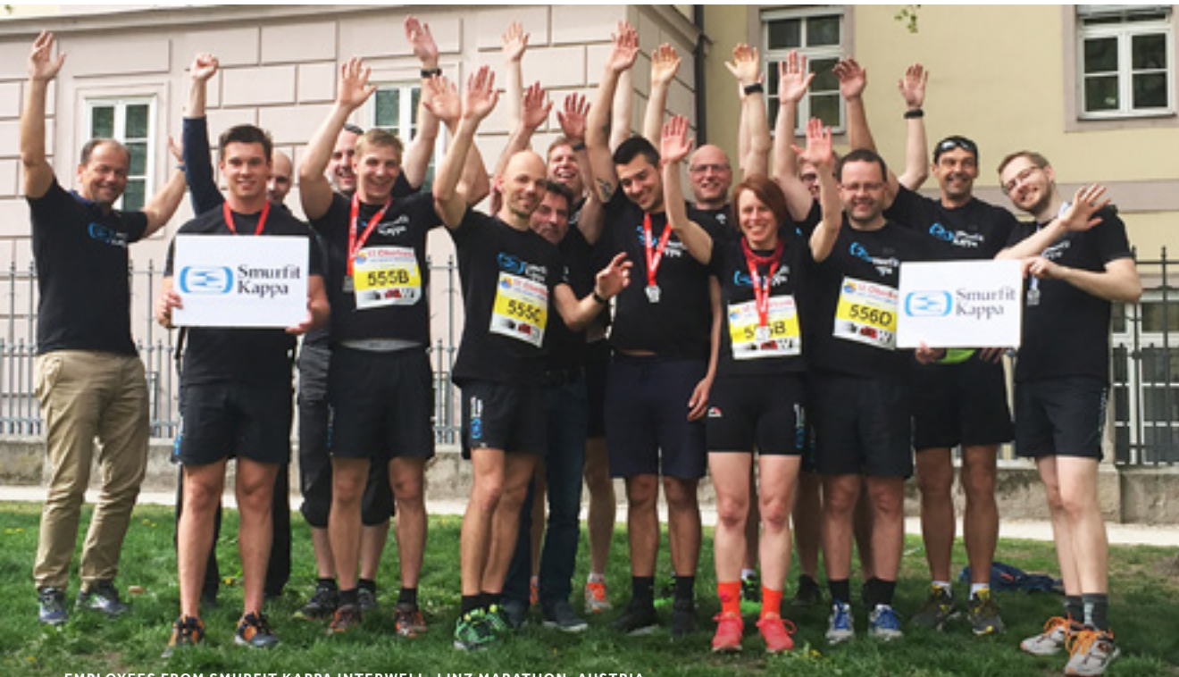
EMPLOYEES FROM SMURFIT KAPPA INTERWELL, LINZ MARATHON, AUSTRIA

A group of employees from the Bag-in-Box plant in Epernay started an annual tradition of doing the 10km d'Epernay race back in 2016 and it has been greatly enjoyed by many employees from a wide variety of roles ever since. The race has a scenic route and there's a great sense of team spirit in coming together to train and run.