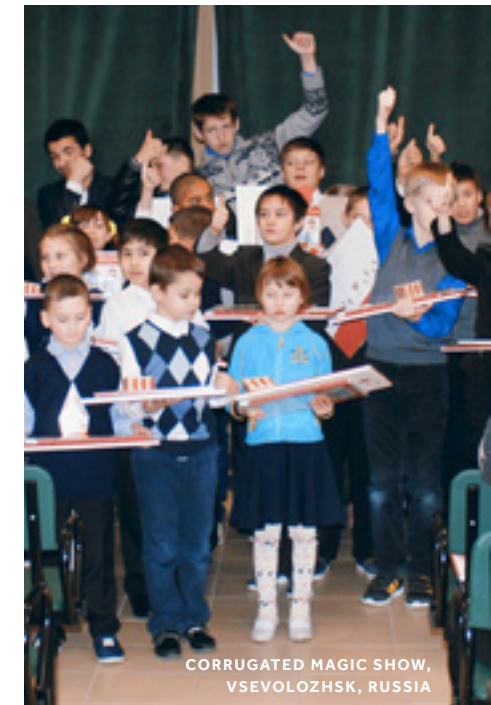
CORRUGATED MAGIC SHOW, VSEVOLOZHSK, RUSSIA

Smurfit Kappa supports many children's initiatives in the communities of Vsevolozhsk and Kommunar in Russia. One of our designers from St. Petersburg had the brainwave of creating a 'Corrugated Magic Show'. The show was performed at the New Year's celebration of a boarding school for children with special needs. It got a fantastic response from the children who said that it was the best show they had ever seen.