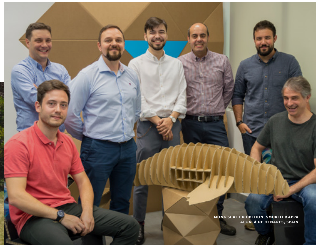
MONK SEAL EXHIBITION, SMURFIT KAPPA ALCALÁ DE HENARES, SPAIN

The plant's Design Team created all the materials for the exhibition and there was a fantastic response from both adults and children who came along to learn more.