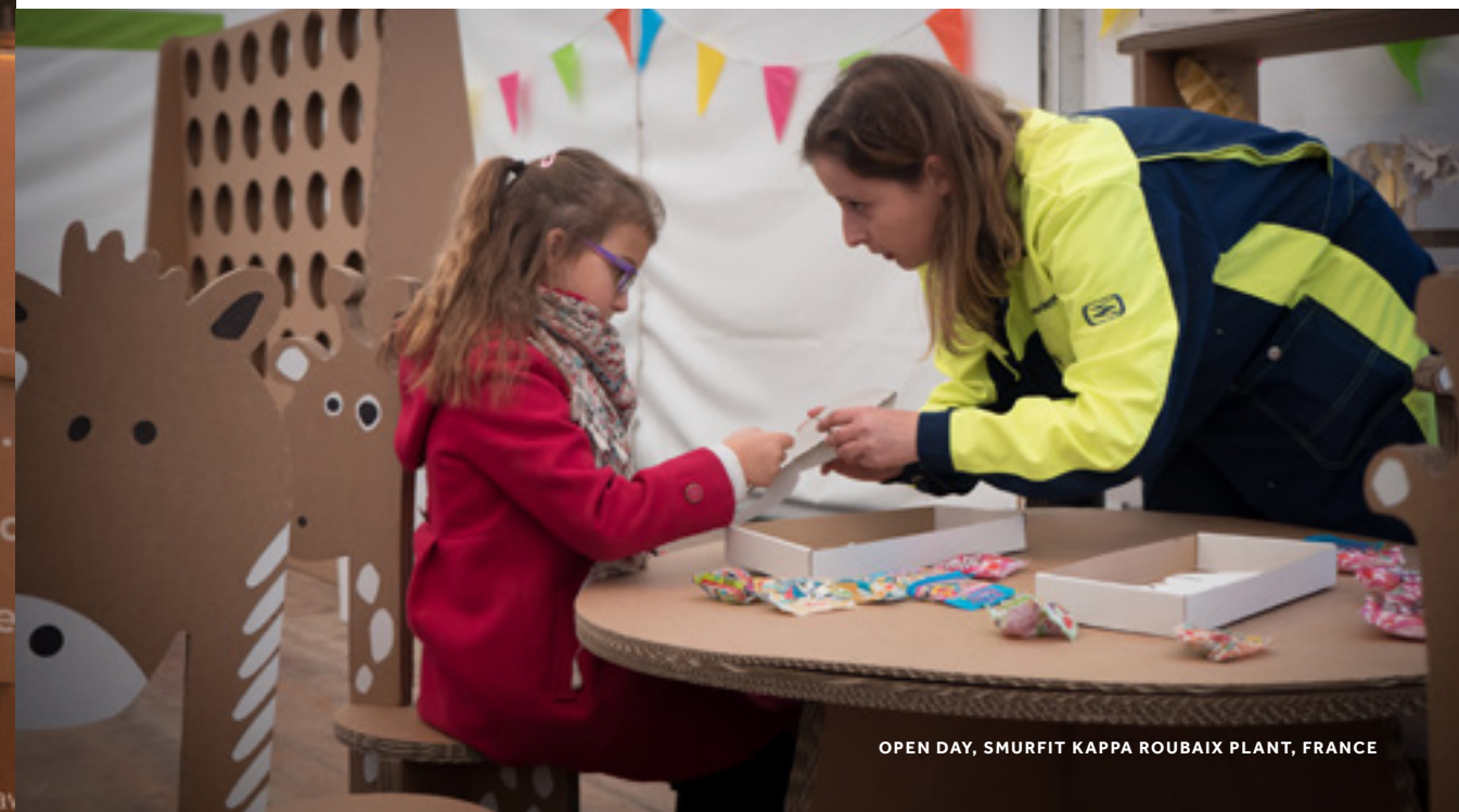
OPEN DAY, SMURFIT KAPPA ROUBAIX PLANT, FRANCE

The Smurfit Kappa Roubaix Plant in France opened its doors to employees' families and local people. A plant tour was given, providing an insight into our operations and processes. Visiting children were entertained with a fantastic array of toys and games created from corrugated board including football, Connect 4, a toy farm and table tennis.