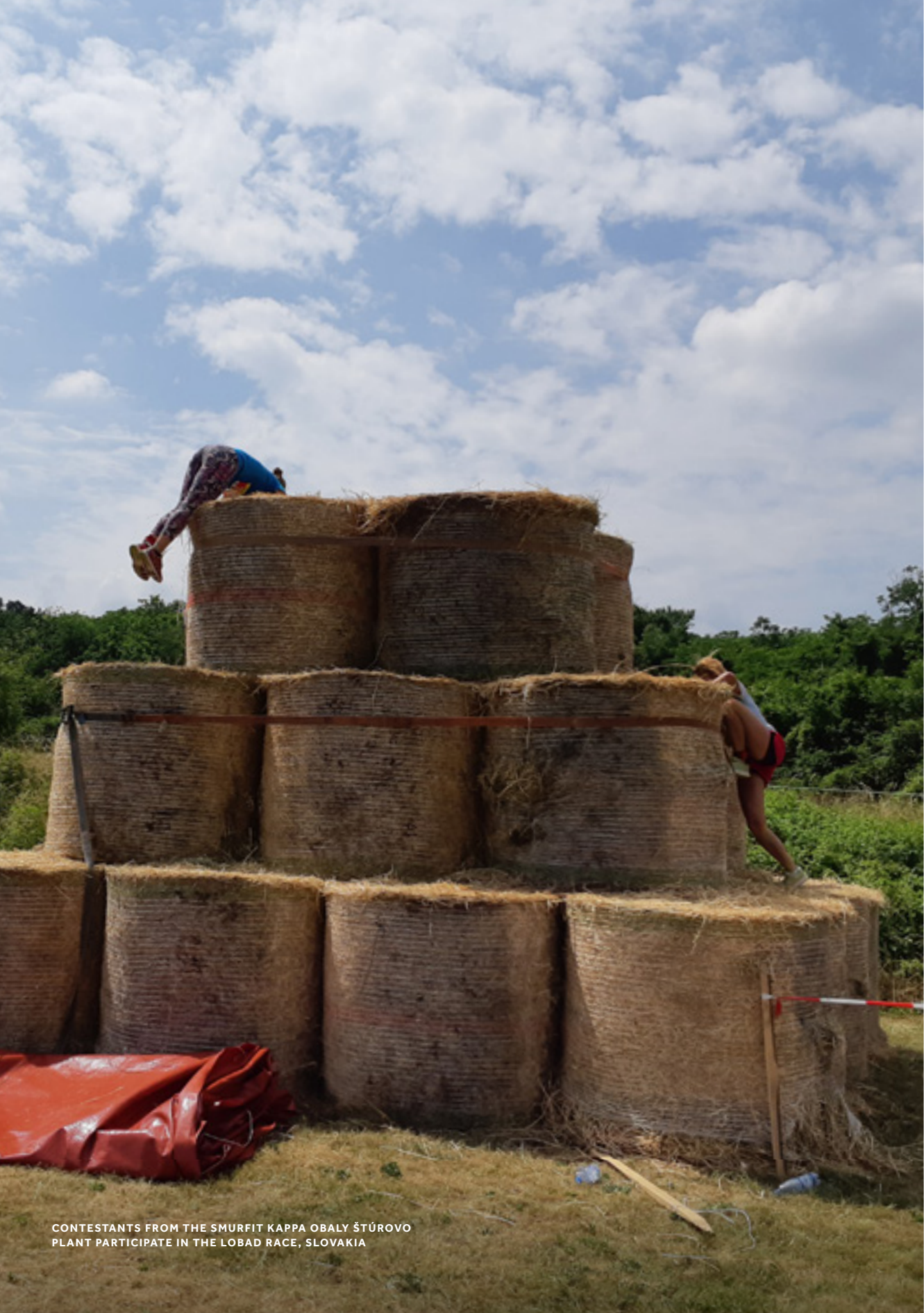
CONTESTANTS FROM THE SMURFIT KAPPA OBALY ŠTÚROVO PLANT PARTICIPATE IN THE LOBAD RACE, SLOVAKIA