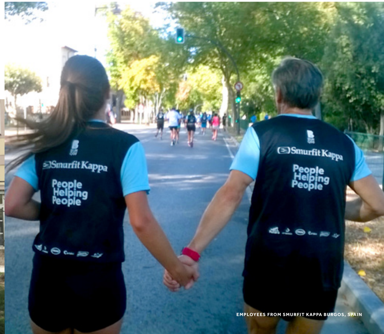
EMPLOYEES FROM SMURFIT KAPPA BURGOS, SPAIN

The Smurfit Kappa Burgos plant in Spain wanted to do something to help the local community, so they started an annual race to raise funds, this time to build an integrated Paediatric Palliative Care Unit in Burgos. Employees from many different departments and local people came together to take part in this worthwhile initiative. It has been a great way to foster team spirit and build a positive reputation for Smurfit Kappa in the area.