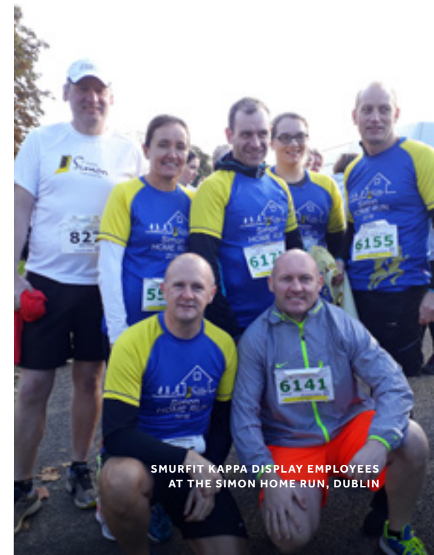
SMURFIT KAPPA DISPLAY EMPLOYEES AT THE SIMON HOME RUN, DUBLIN

The Dublin Simon Community homeless charity held a Music Marathon event to raise much-needed funds. A total of 18 established and up-and-coming Irish bands and musicians played during an eight-hour period on the streets of Dublin. The Smurfit Kappa Display Plant in Dublin supported this event by creating an eye-catching, branded arch and also taking part in the Simon Home Run.