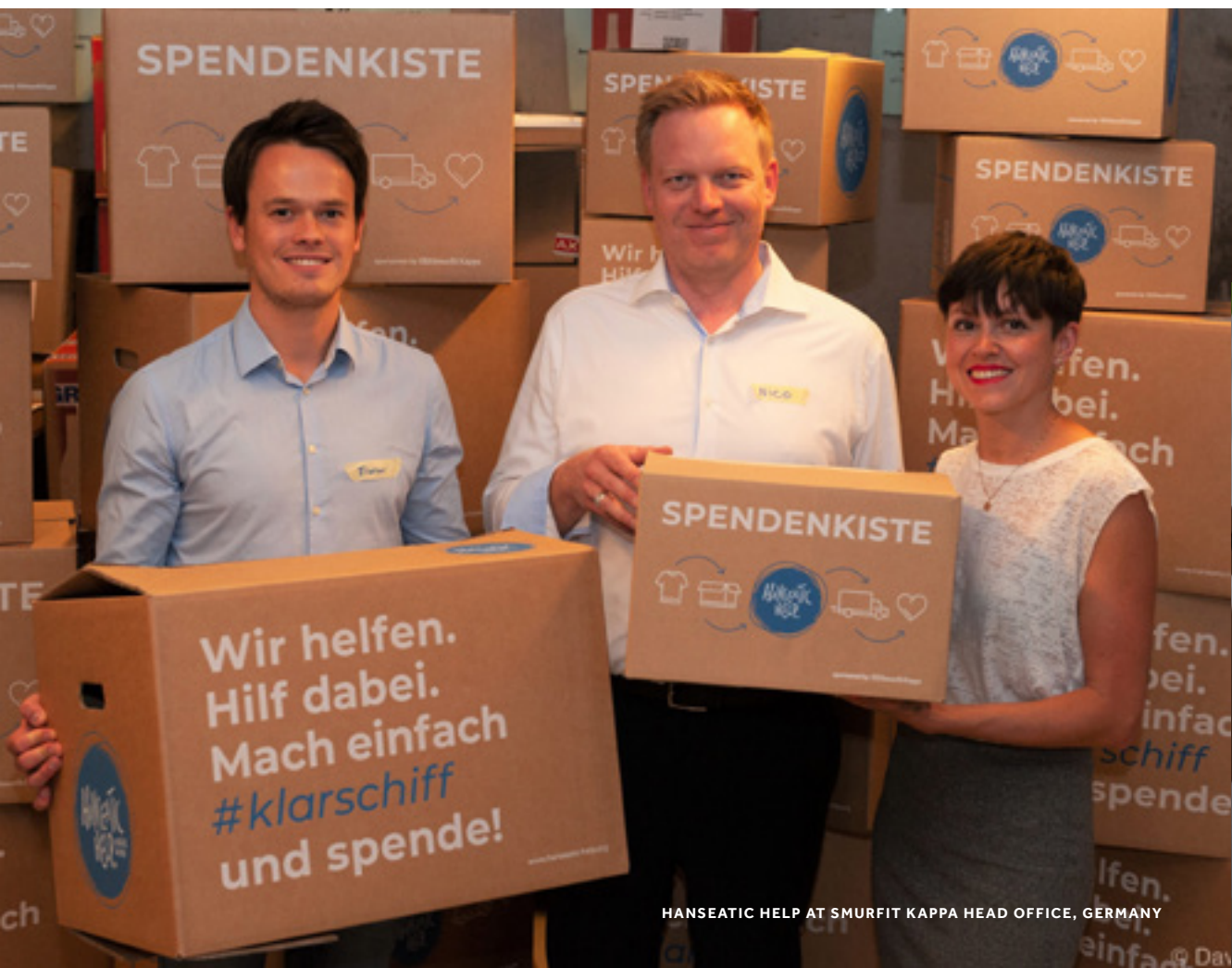
HANSEATIC HELP AT SMURFIT KAPPA HEAD OFFICE, GERMANY

From the day it opened, Corrumed set out to employ people from the neighbouring area and today approximately 60% of their workers live within a 3km radius of the plant. In doing so, not only has Corrumed contributed to improving quality of life in the area but also to social development, providing job security to employees and an improved quality of life for their families.