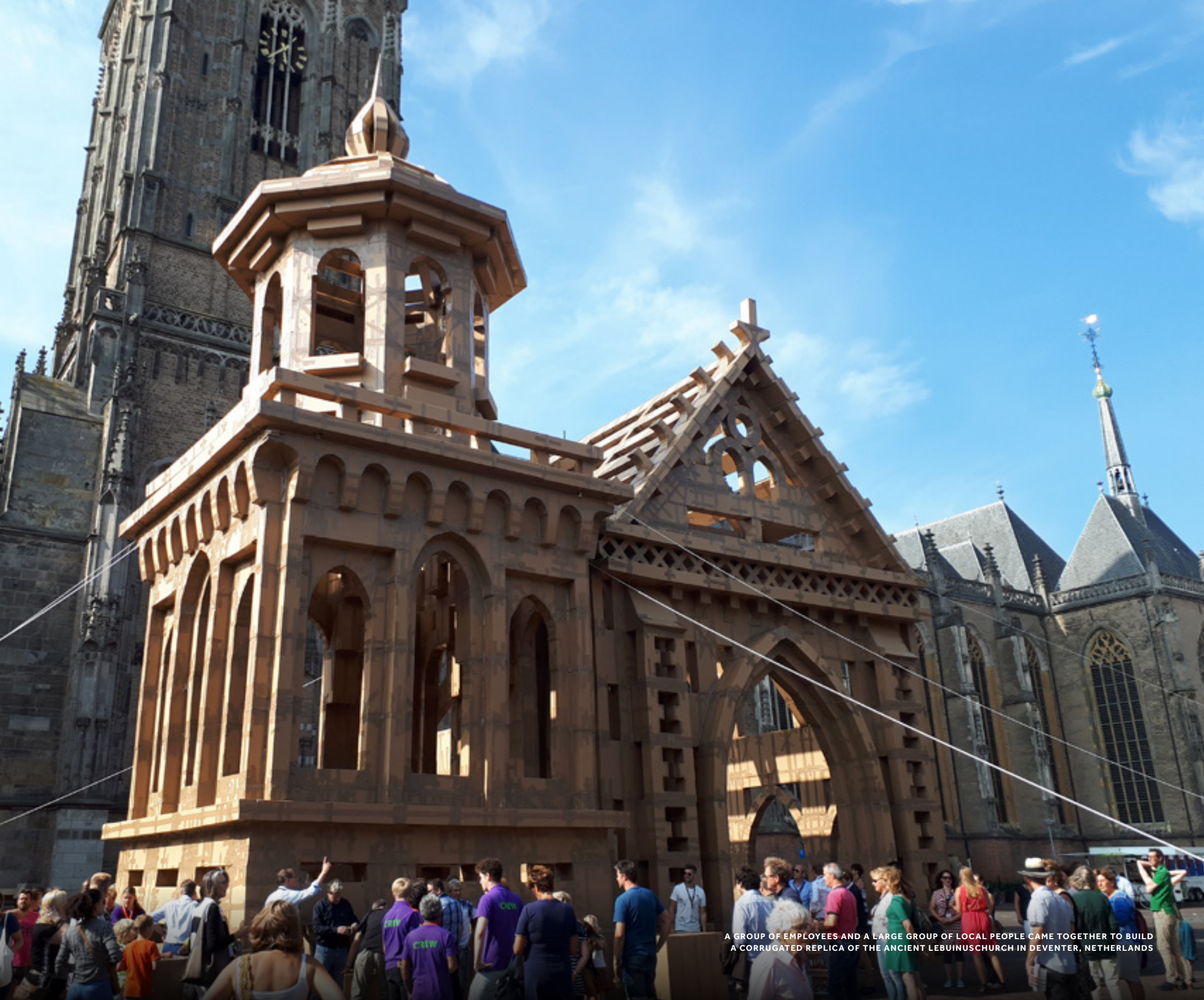
A GROUP OF EMPLOYEES AND A LARGE GROUP OF LOCAL PEOPLE CAME TOGETHER TO BUILD A CORRUGATED REPLICA OF THE ANCIENT LEBUINUSCHURCH IN DEVENTER, NETHERLANDS