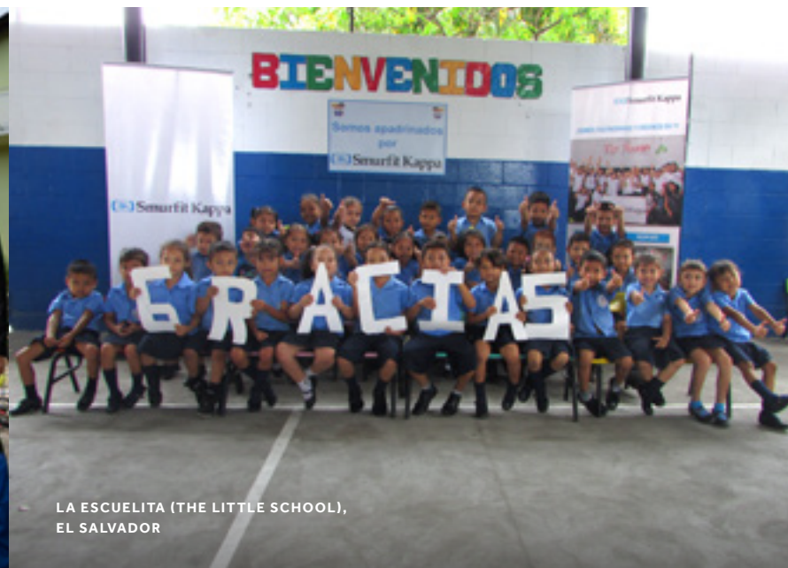
LA ESCUELITA (THE LITTLE SCHOOL), EL SALVADOR