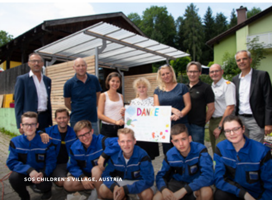
SOS CHILDREN'S VILLAGE, AUSTRIA

Smurfit Kappa in Ecatepec, State of Mexico, founded a local community centre close to the Cerro Gordo Plant as there was a lack of recreational spaces in the area. The project, which originated as a football school, has become a fantastic amenity for the region servicing 380 people. The community centre offers a variety of stimulating classes and workshops for children. Facilities include a library, playroom, football courts, greenhouse and changing rooms.