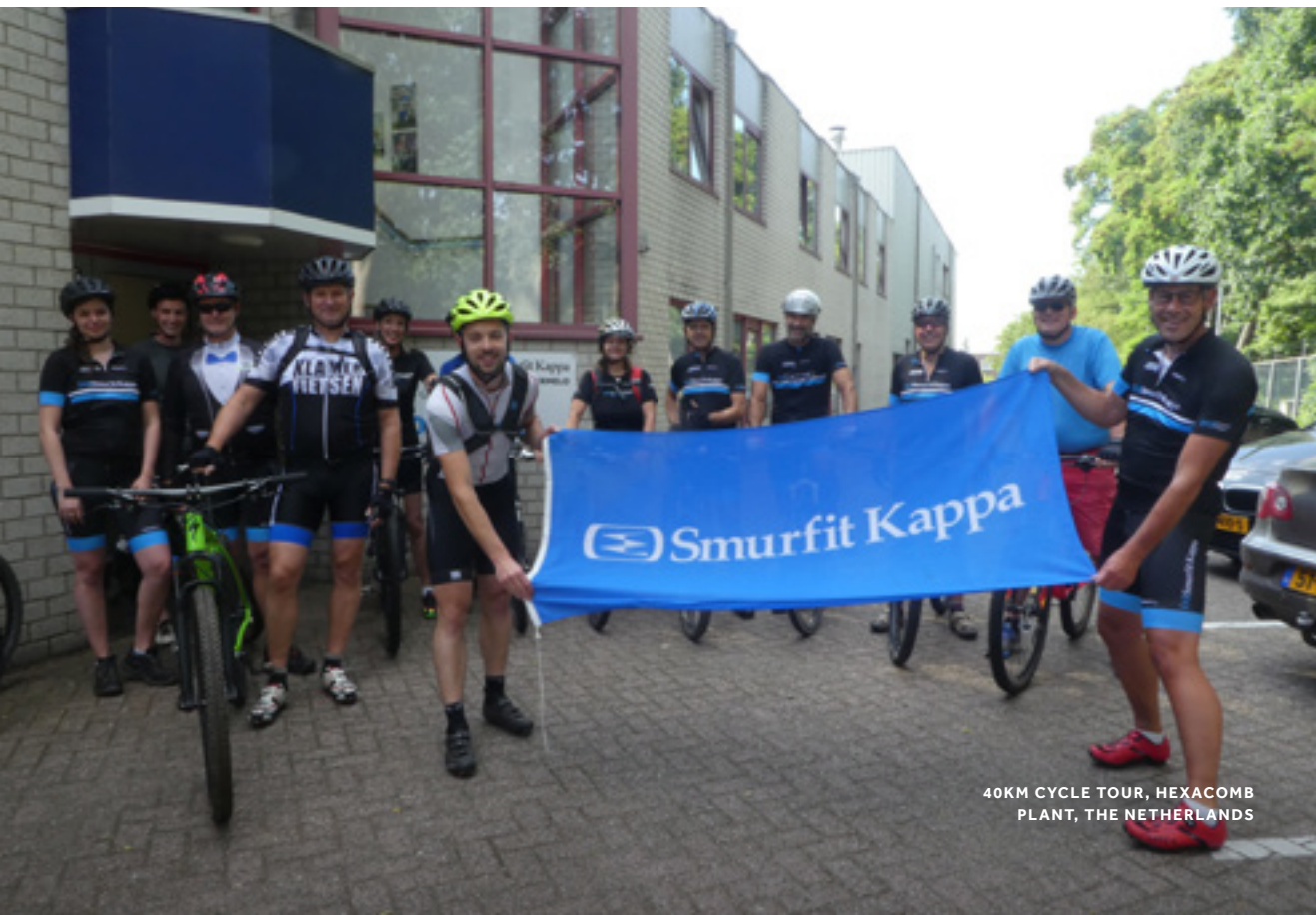
40KM CYCLE TOUR, HEXACOMB PLANT, THE NETHERLANDS

A group of cycling fanatics from the Smurfit Kappa Hexacomb Plant in the Netherlands invited all their colleagues out for a bike tour. Dressed in Smurfit Kappa cycling gear, they set off on a 40km tour and were rewarded at the end with a nice dinner.