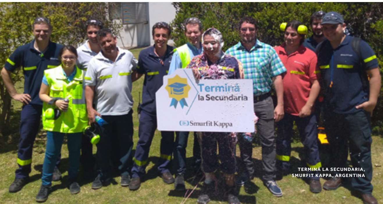
TERMINÁ LA SECUNDARIA, SMURFIT KAPPA, ARGENTINA

Many employees wanted to be part of the initiative so they became volunteers on the scheme and are now able to give their support to the students. As of today there are more than 100 students and 3 graduates.