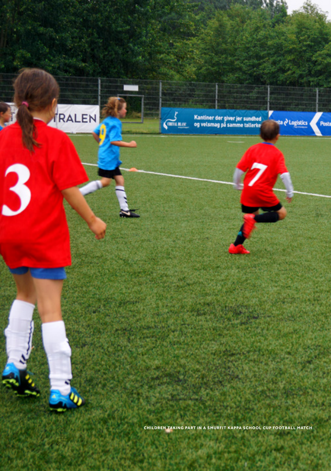
CHILDREN TAKING PART IN A SMURFIT KAPPA SCHOOL CUP FOOTBALL MATCH