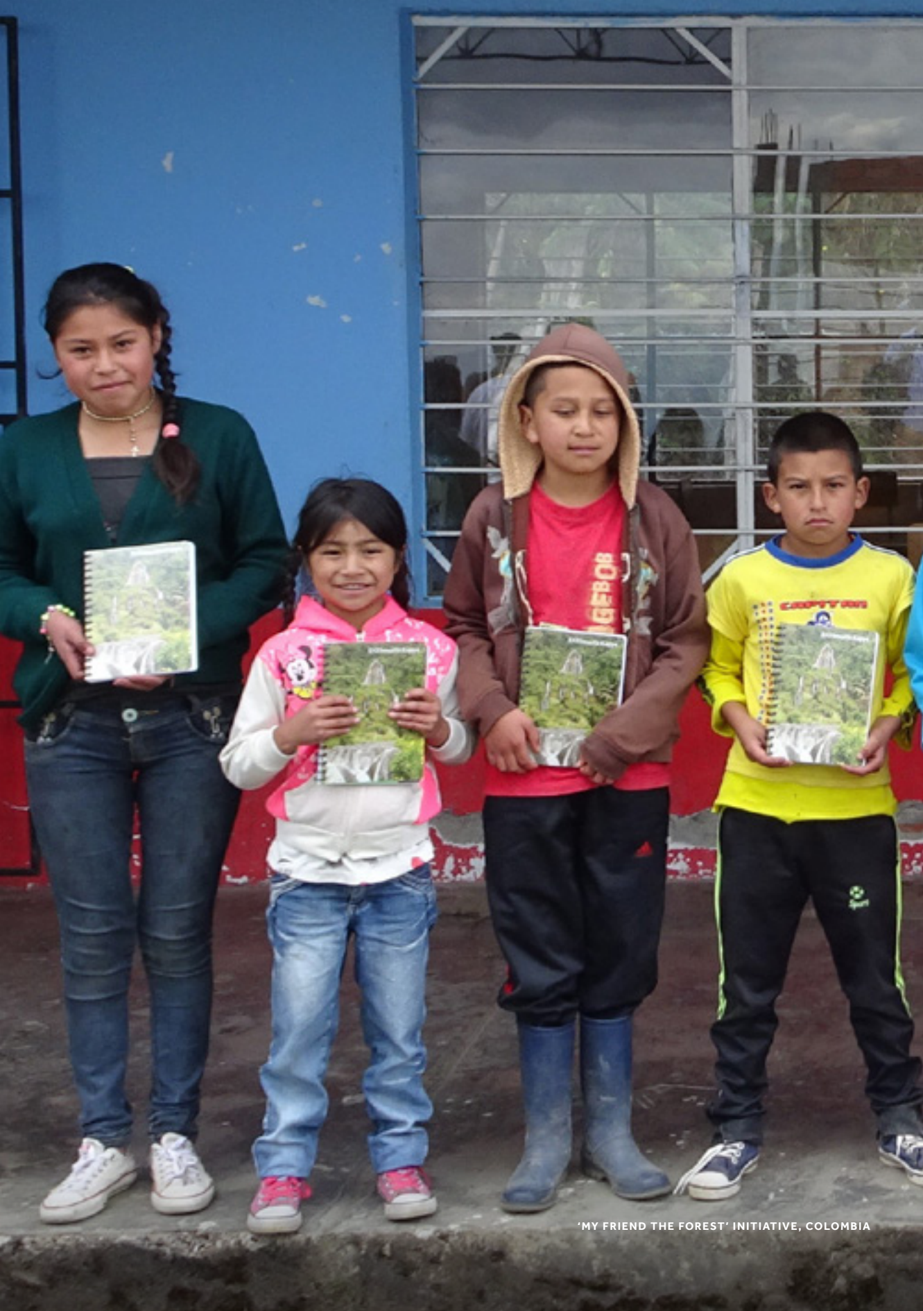
'MY FRIEND THE FOREST' INITIATIVE, COLOMBIA